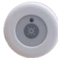
This touch is included in article no. 21-19x4-5