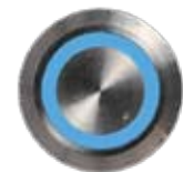
This LED button is included in article no. 21-19x6-5